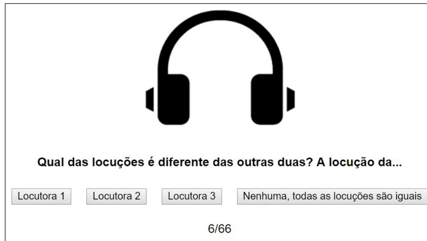
Figure 2: Screenshot of the perception test design.